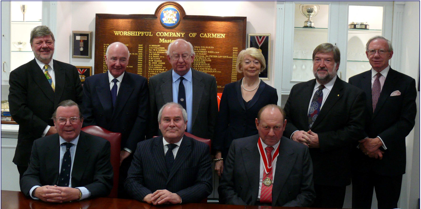
The Trustees welcome The Master of the Carmen's Company to the January 2008 Trustees' meeting.