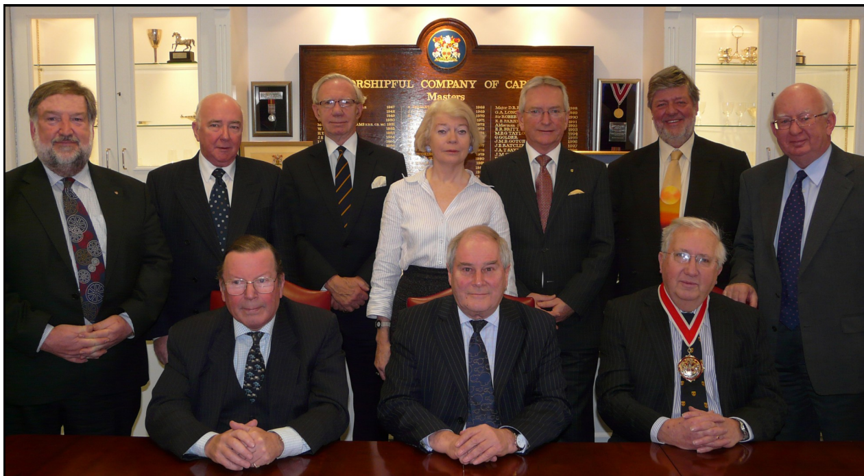
The Trustees welcome The Master of the Carmen's Company to the January 2009 Trustees' meeting.