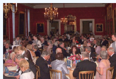
The Picture Gallery, St. James's Palace. The Carman, banqueting in style to raise funds for the charities, Give Them A Sporting Chance and the Variety Club's "Reach for the Stars" appeal.

On 3 rd June, Her Royal Highness The Princess Royal, Past Master Carman, held a dinner for our Company in the magnificent setting of St James's Palace. In association with the dinner a total of over £30,000 was raised for our Benevolent Trust.