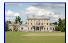
The City of London Freeman's School