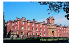
King Edward's, Witley

The City of London Guilds and Livery Companies were asked to provide the funding needed to feed and clothe the inhabitants and to this day KES, long since relocated to the Surrey countryside, continues to approach these institutions and charities for financial assistance to enable proven needy children to enter the school.