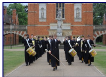
The Christ's Hospital band performing at the school.

In the decades following the Carmen's Royal Charter of 1946, Carmen generously revived their ancient connection with CH and the Carmen's Benevolent Trust has been pleased once again to support the education of pupils at the school.